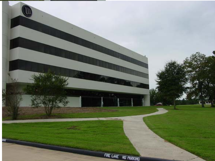
LOOKING WEST ACROSS THE FRONT OF THE BUILDING