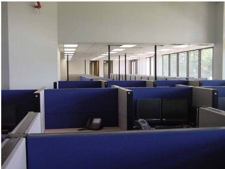
ANOTHER VIEW OF THE HOT-SITE AREAS. THESE ARE CUSTOM BUILT FOR EACH CLIENT