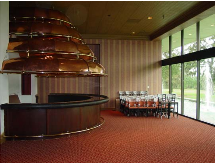
THE FIRST FLOOR FRONT BAR (USED FOR PRESENTATIONS AND MEETING AREA)