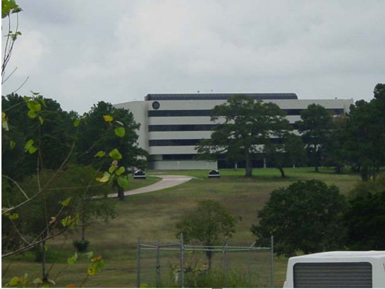
VIEW FROM THE FRONT LOOKING SOUTH