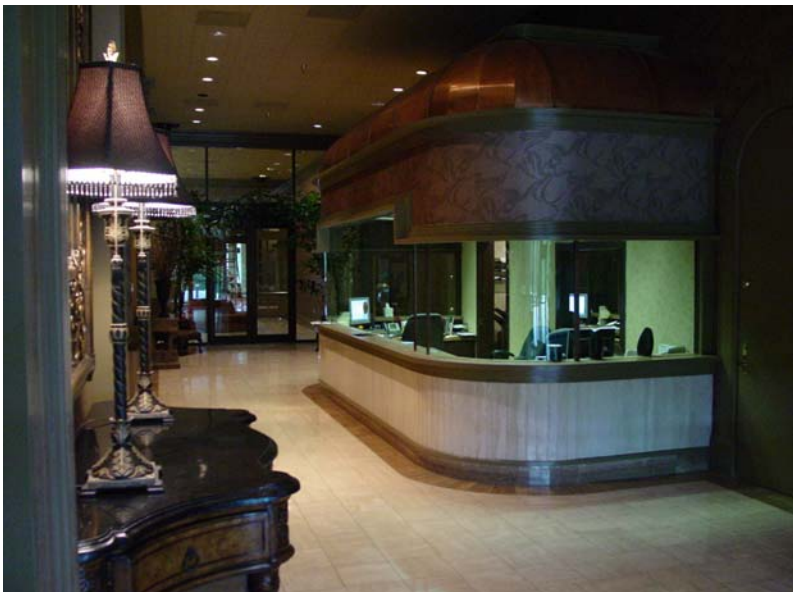
THE FRONT LOBBY AND RECEPTIONIST AREA